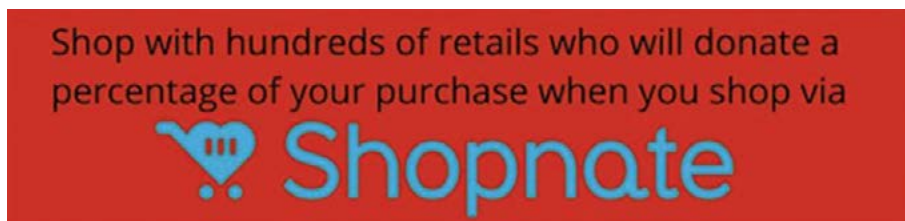
Half Banner - 600px (W) x 160px (H)