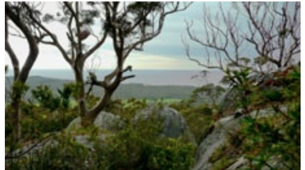
The view from Mount Hallowell.

Today's walk is best completed as a one-way trail, so you will need to organise a lift to and from the Track. Stop in at the Denmark Visitor Centre to arrange a track transfer with one of the local transport operators.