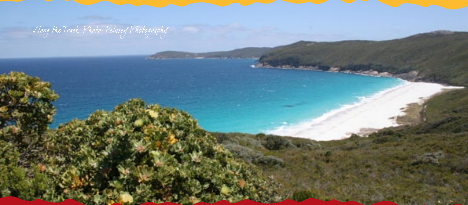
Along the Track.

To reach the lookout, turn left at a T-junction (where the Bibbulmun Track continues right) and continue 250m to the lookout.