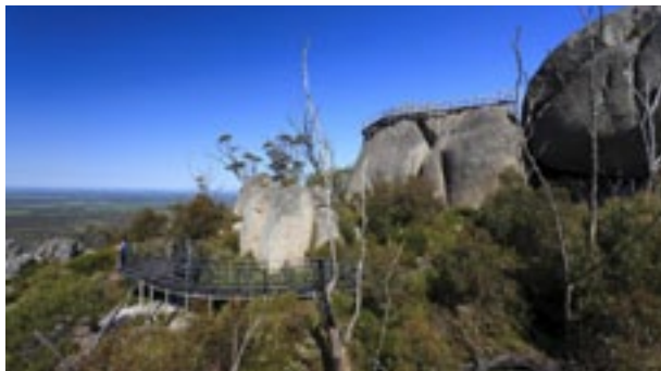
The Granite Skywalk.