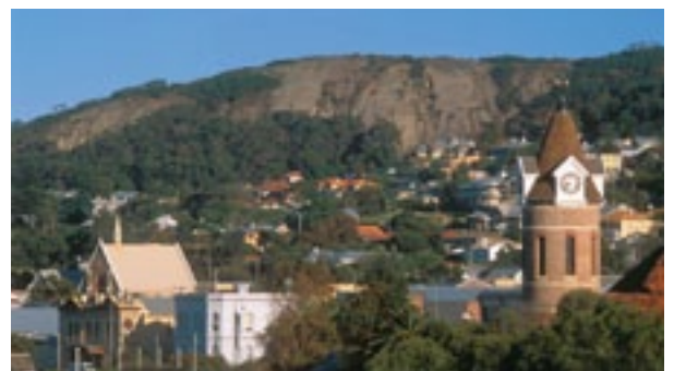
The historic town of Albany is home to the Southern Terminus of the Bibbulmun Track.

When it's time to rest, Albany offers plenty of accommodation, ranging from boutique hotels and chalets to budget caravan and campsites and everything in between. Visit our website to find walker-friendly businesses in the area.