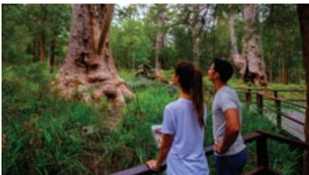
Ancient Empire Walk.

Starting at beach level (follow the boardwalk down to the beach from the car park), this return walk takes a steep climb to the edge of Conspicuous Cliffs to provide incredible views of the Southern Ocean. The Track then meanders through undulating coastal heath to the picturesque Rame Head Campsite. If you're a bird-lover, keep an eye out for the tiny colourful wrens that live in the area.