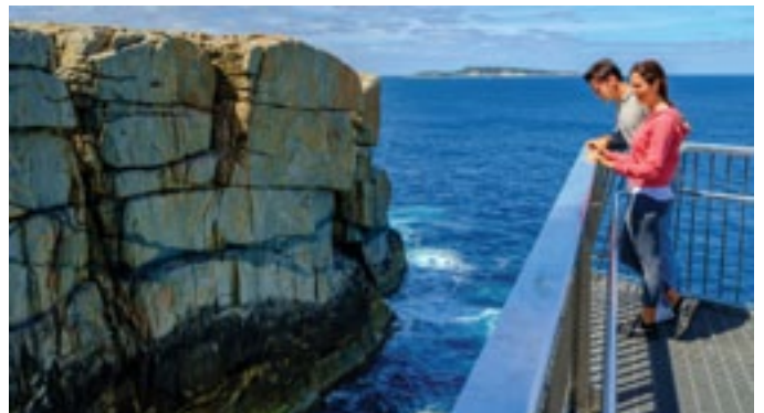
The Gap, Torndirrup National Park.