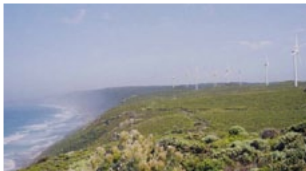
Views over the Albany Wind Farm

to colonies of little penguins and flesh-footed shearwaters. As you walk along the Track (away from the beach) you'll have a fantastic view over the coastline and if you're lucky the chance to spot passing dolphins or whales. After a short break at the Mutton Bird Campsite, retrace your steps back to the car park. For a full-day walk , you can continue along the Track to the Sandpatch car park and Albany Wind Farm, or further still to the Sandpatch Campsite.