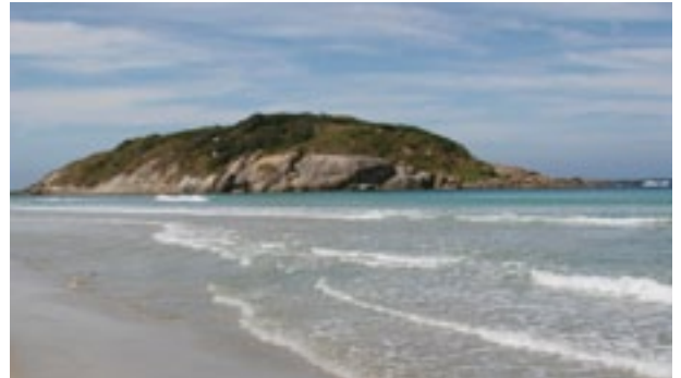
Shelter Island.

To get there, take Lower Denmark Road and turn left on to Elleker-Grasmere Road, then right on to Mutton Bird Road. Drive 8.5 kms to Mutton Bird Beach car park.