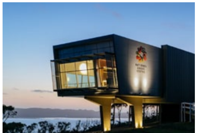
National Anzac Centre, Albany.