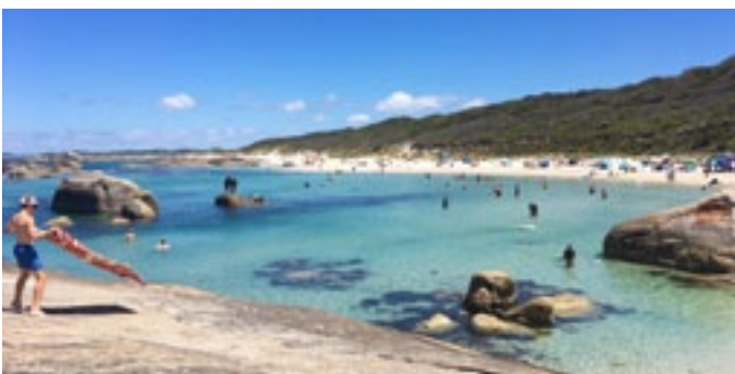
A summer day at Greens Pool, Denmark