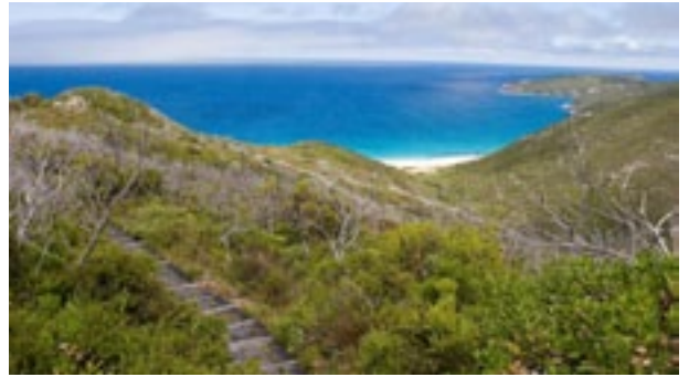
Views over West Cape Howe.

From Lower Denmark Road, turn left on to Cosy Corner Road and park at the Cosy Corner picnic area. Look for the Bibbulmun Track signs to begin today's walk.