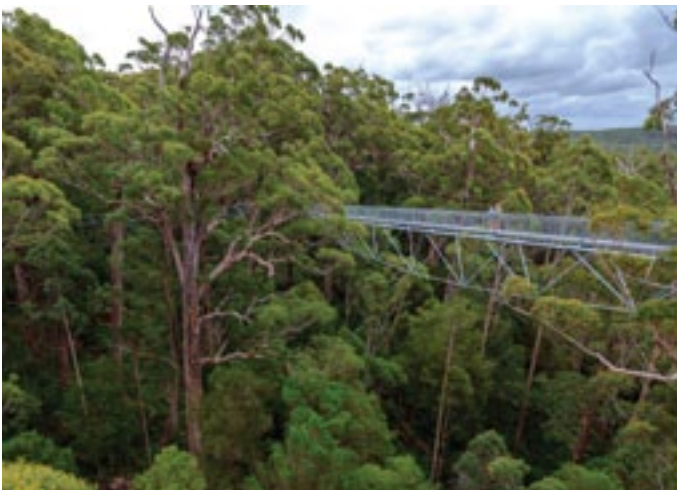
Valley of the Giants Tree Top Walk.