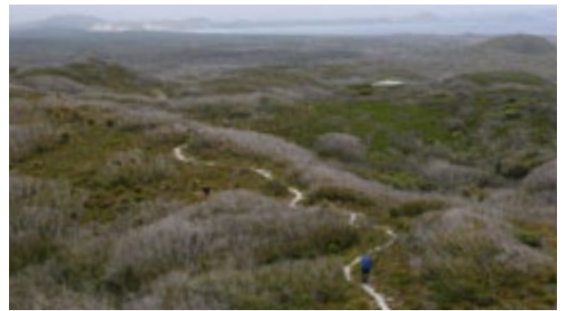
Approaching Rame Head Campsite.

After a tasty breakfast from one of Denmark's cafes, drive 40 minutes along South Coast Highway and turn right onto Conspicuous Beach Road to reach Conspicuous Beach, the starting point of today's Track walk that takes in some of WA's most pristine coastline.