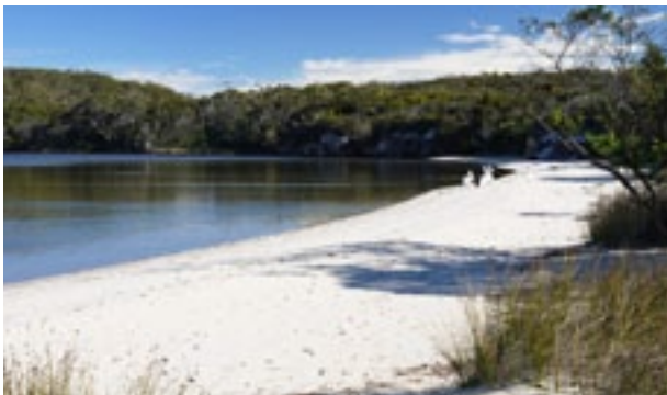
Coalmine Beach, Nornalup Inlet.