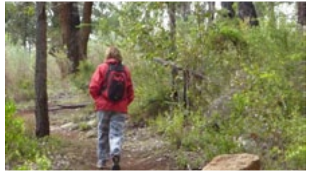
Walking up to Castle Rock.

Albany is a four-and-three-quarter-hour drive from Perth along the Albany Highway and is the Southern Terminus of the Bibbulmun Track. About two hours from Perth, take a break at the Williams Woolshed , where you can enjoy a bite to eat and browse local produce and wool products. When you're ready, continue along Albany Highway.