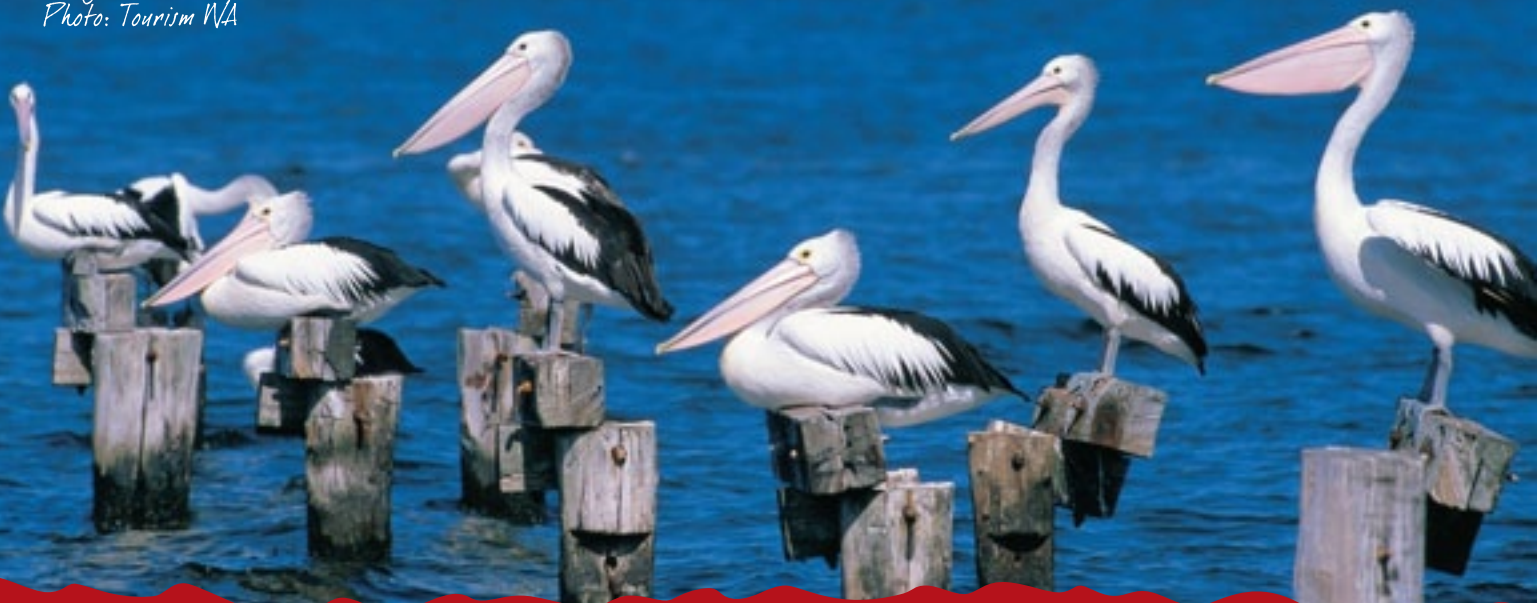
Posing pelicans at Walpole Inlet.

Check out our other itineraries for more Track walks and attractions that you can enjoy on your way home.