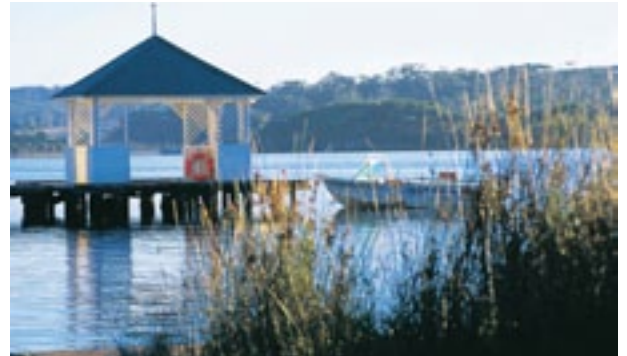
Rest Point at Walpole Inlet.

From Walpole, take the 10 minute drive east along the South Coast Highway and turn right onto Coalmine Beach Road to reach Knoll Drive, a five kilometre scenic loop with beautiful views over the Walpole and Nornalup Inlets. Bring along some morning tea to enjoy at one of the peaceful picnic spots along the drive.