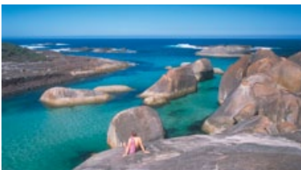
Elephant Rocks.

Starting at Lights Beach (near the toilets), the Track meanders east through coastal heath and farmland before turning north and ascending to Monkey Rock. You will then climb even higher through towering karris to Mount Hallowell. Here you can enjoy views of rolling green hills, the Wilson Inlet and the Southern Ocean, before descending past gigantic boulders and sheoak forest through to Ocean Beach Road.