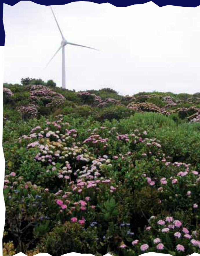
Abundance of wildflowers near the Albany windfarm

In amongst all these awe-inspiring giants, we didn't forget to have our eyes peeled for the smaller understorey plants, and at last I came across a Kangaroo Paw in flower—delicate pale pink and green, near the Frankland River, and nearby a small and wispy tree with a rather amusing common name of snottygobble.