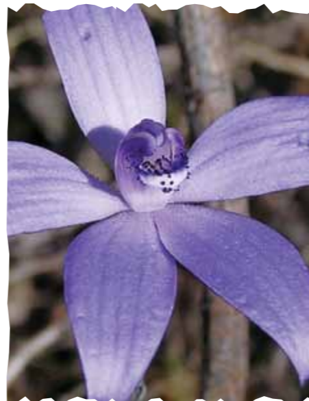
Silky Blue Orchid

A scenic two hour drive through the Shannon National Park on day five took us into the heart of karri country near Pemberton, where we started walking from the Beedelup Falls. A highlight of the day was the famous Gloucester Tree, the tallest fire lookout tree in the world. Standing at about 60m tall the lookout gallery at the top has become a favourite tourist attraction, which can be reached by climbing 153 steel spikes spiralling around the