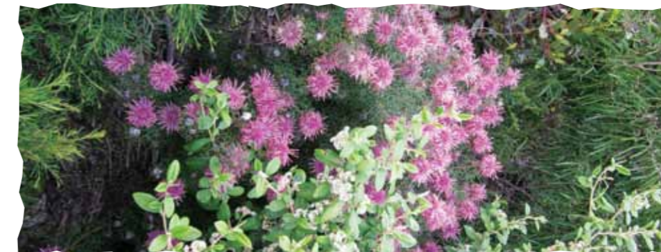
Rose Coneflower on the south coast

What fabulous eight days they were, each day filled with spectacular floristic and other highlights, leaving heart, soul, mind and body hugely refreshed and enriched, not to mention the further realisation that no landscape designer can ever design a garden as well as nature does!