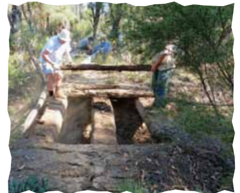
Out with the old