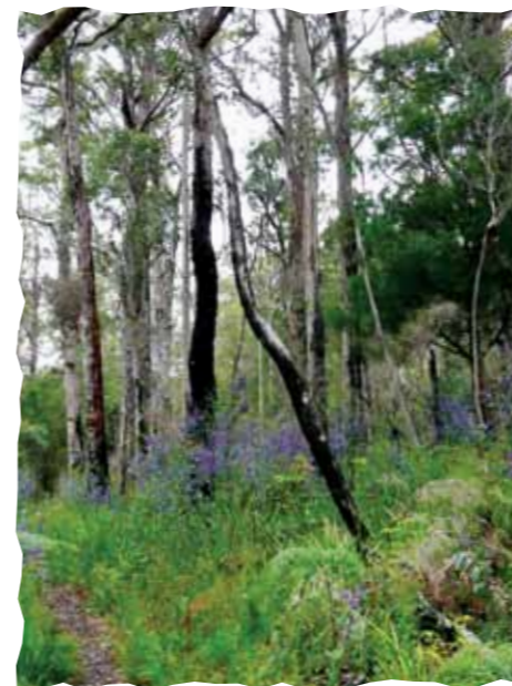
Deep purple native wisteria