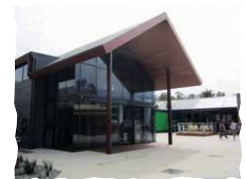
The new Zig Zag Cultural Centre

Information on all of the above can be obtained from the visitor centre by phone: (08) 9257 9998 or email: zzcc@kalamunda.wa.gov.au