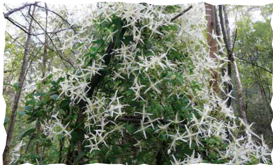
Stunning display of old man's beard

Day four of the walk took us to another spectacular forest giant, the Giant Tingle Tree. The tree has been hollowed out by many fires, but at circa 400 years old it is still very much alive. To protect it and its roots from the tourists, a boardwalk has been constructed around it.