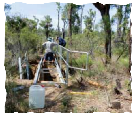
In with the new