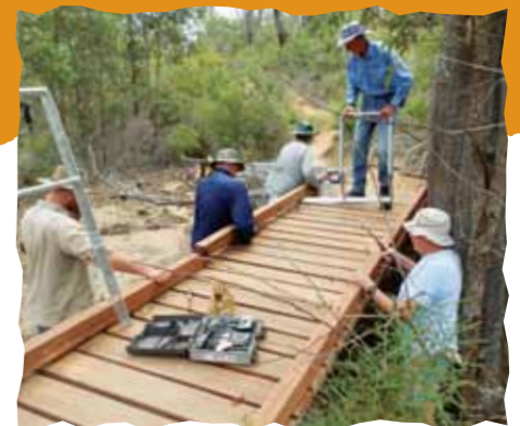
Fitting railings to bridge erected in March 2011 by volunteers.