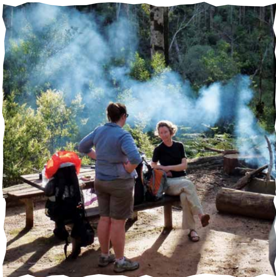
Laughing Ladies at Camp