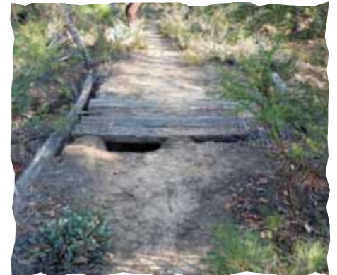
The old bridge on the rail formation