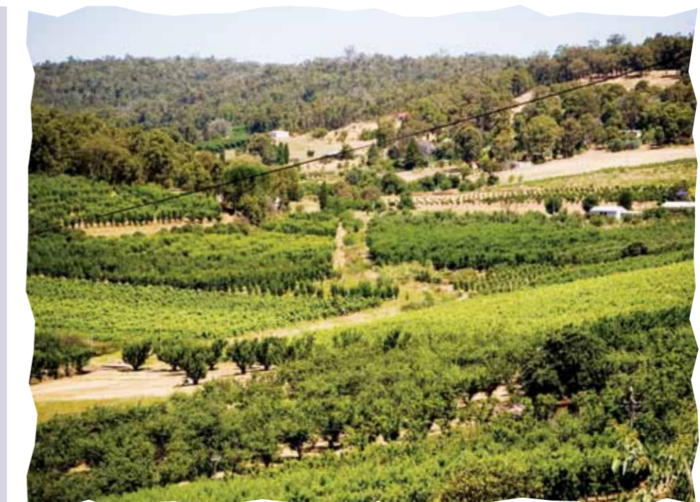
Carmel Valley is renowned for its local produce

For more information visit www.mundaringtours.com.au Email mundaringtours@bigpond.com or call 0407 429 904