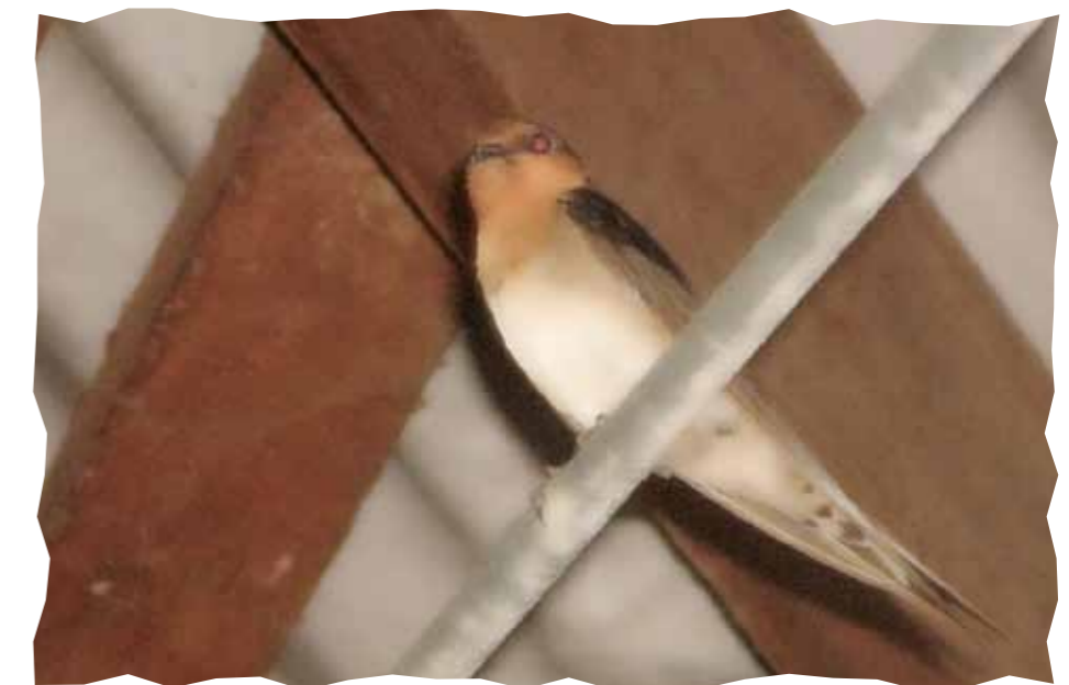
Can anyone identify the birds nesting at Boat Harbour Campsite?