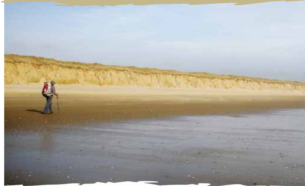
Israeli trampers 'Yeti' on the 90-mile beach section at the start of Te Araroa.

Te Araroa Trust lists the really big rivers such as the Rangitata and Rakaia that have braided beds, ie a network of many channels, kilometres wide, as hazard zones. Crossing is not recommended, and trampers need to pay for a jet boat ride or simply hitch around to the far bank.