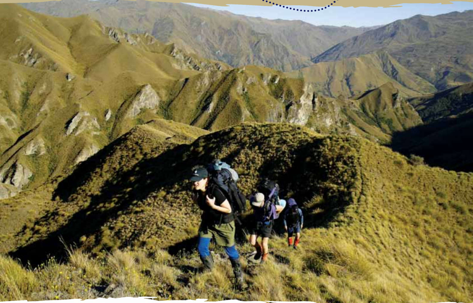
Te Araroa Trampers on the Motatapu Alpine section of the trail, gifted in 2004 by Canadian singer Shania Twain and her then-husband Mutt Lange.

Fifteen years after its inception, New Zealand's long Trail finally opened at the end of 2011.