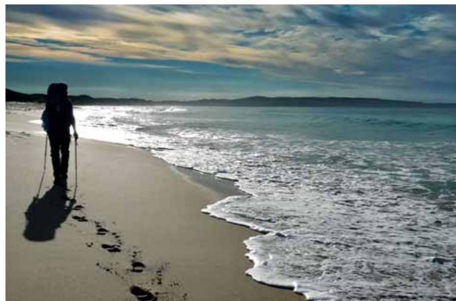
Walking on the South Coast.

Office Manager and Volunteer Coordinator